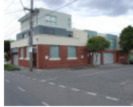
Keele St 58-60.JPG