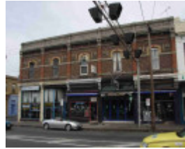
Collingwood Johnston Street 5-11.JPG