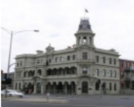
HOTEL VICTORIA SOHE 2008