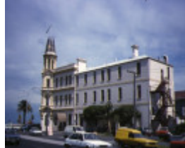
hotel victoria beaconsfield parade albert park side view