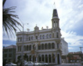
hotel victoria beaconsfield parade albert park front view