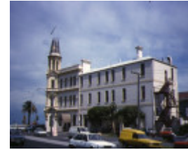
hotel victoria beaconsfield parade albert park side view