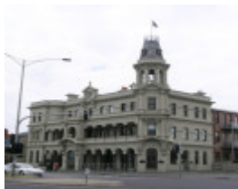
HOTEL VICTORIA SOHE 2008