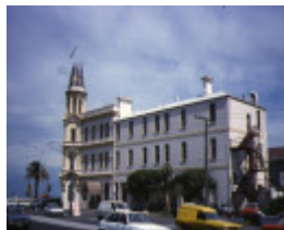
hotel victoria beaconsfield parade albert park side view