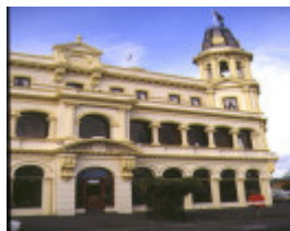
1 hotel victoria beaconsfield parade albert park front elevation