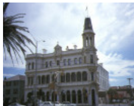
hotel victoria beaconsfield parade albert park front view