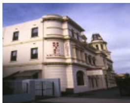
hotel victoria beaconsfield parade albert park side elevation