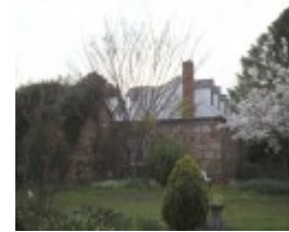
former travellers rest inn batesford side view oct1985