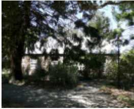
FORMER TRAVELLERS REST INN SOHE 2008