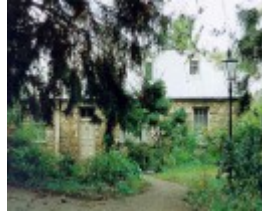
former travellers rest inn batesford front elevation publication