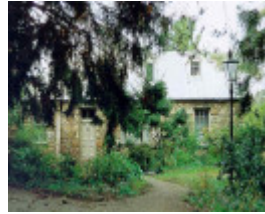
former travellers rest inn batesford front elevation publication