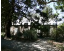
FORMER TRAVELLERS REST INN SOHE 2008