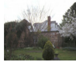
former travellers rest inn batesford side view oct1985