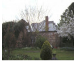
former travellers rest inn batesford side view oct1985