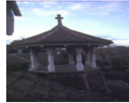
auld reekie royal parade parkville detail turret jun1980