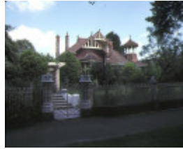
1 auld reekie royal parade parkville front view of property dec1978