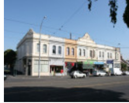
Lygon St 569-585.JPG