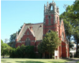
FORMER COLLEGE CHURCH SOHE 2008