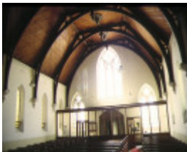
presbyterian college church royal prd parkville interior back jan1997