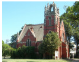
FORMER COLLEGE CHURCH SOHE 2008