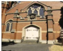
presbyterian college church royal prd parkville detail front entrance jan1997