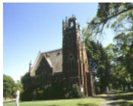
1 presbyterian college church royal prd parkville front view jan1997