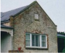
laurence park homestead buchter road batesford front window detail publication