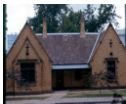
h00919 gatekeepers cottage2