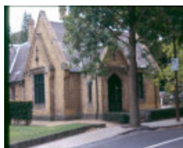
h00919 gatekeepers cottage1