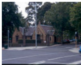
h00919 gatekeepers cottage4