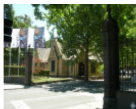
GATEKEEPER'S COTTAGE SOHE 2008