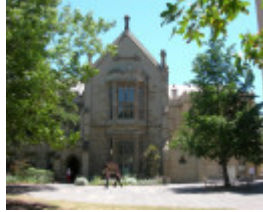
LAW SCHOOL BUILDING AND OLD QUADRANGLE SOHE 2008