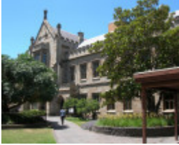
LAW SCHOOL BUILDING AND OLD QUADRANGLE SOHE 2008