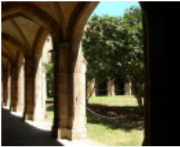
LAW SCHOOL BUILDING AND OLD QUADRANGLE SOHE 2008