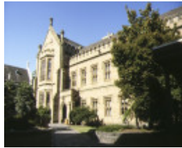
1 law school building & old quadrangle university of melbourne parkville west facade