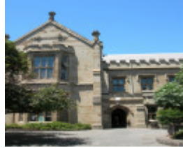
LAW SCHOOL BUILDING AND OLD QUADRANGLE SOHE 2008