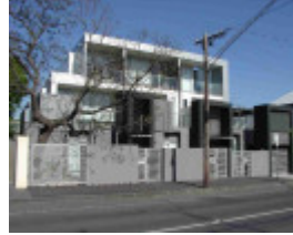
Richmond Lennox Street 275- 279.JPG