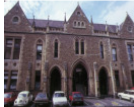
1 old pathology building university of melbourne parkville front entrance may 1989