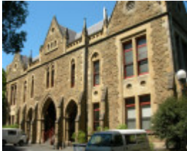
OLD PATHOLOGY BUILDING SOHE 2008