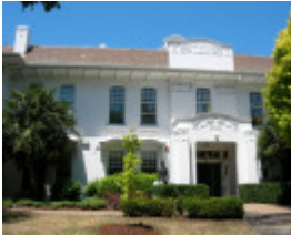
CONSERVATORIUM OF MUSIC AND MELBA HALL SOHE 2008