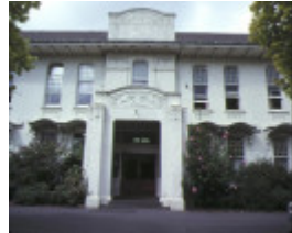
1 conservatorium of music & melba hall university of melbourne parkville front view mar1979