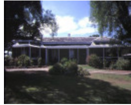
1 wentworth house pascoe vale south front view