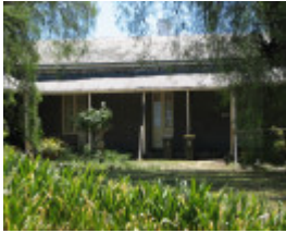
WENTWORTH HOUSE SOHE 2008