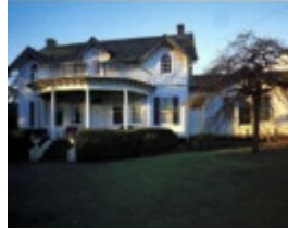
MULBERRY HILL SOHE 2008 H0745 mullberry