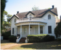
MULBERRY HILL SOHE 2008