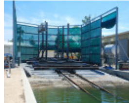
SLIP AND WINCH SHED SOHE 2008