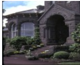
1 kolor homestead penshurst warmnambool road penshurst entrance nov1980