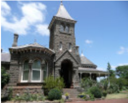
KOLOR HOMESTEAD SOHE 2008