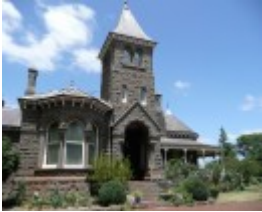
KOLOR HOMESTEAD SOHE 2008