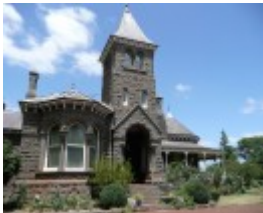
KOLOR HOMESTEAD SOHE 2008