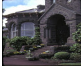
1 kolor homestead penshurst warrnambool road penshurst entrance nov1980