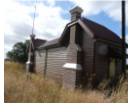
PIRRON YALLOCK RAILWAY STATION COMPLEX SOHE 2008