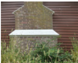
H1584 PIRRON YALLOCK RAILWAY STATION COMPLEX LHA 2015 3.JPG