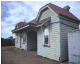
1 pirron yallock railway station complex front view jun1984