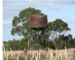
PIRRON YALLOCK RAILWAY STATION COMPLEX SOHE 2008