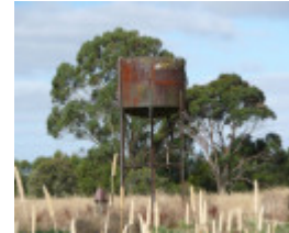
PIRRON YALLOCK RAILWAY STATION COMPLEX SOHE 2008