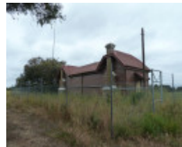
H1584 PIRRON YALLOCK RAILWAY STATION COMPLEX LHA 2015 2.JPG