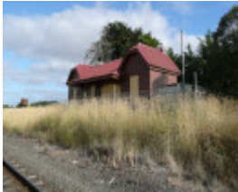
PIRRON YALLOCK RAILWAY STATION COMPLEX SOHE 2008