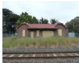
H1584 PIRRON YALLOCK RAILWAY STATION COMPLEX LHA 2015 1.JPG