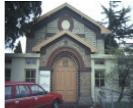
1 port melbourne courthouse policew station & lock up bay street port melbourne front view courthouse