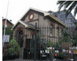
PORT MELBOURNE COURT HOUSE, POLICE STATION AND LOCK-UP SOHE 2008