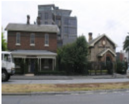
PORT MELBOURNE COURT HOUSE, POLICE STATION AND LOCK-UP SOHE 2008