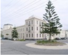
FORMER SWALLOW & ARIELL BISCUIT FACTORY SOHE 2008