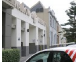
FORMER SWALLOW & ARIELL BISCUIT FACTORY SOHE 2008