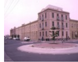
1 former swallow & ariell biscuit factory stokes street port melb corner building jun1995