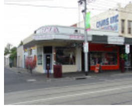
Swan St 63-65.JPG