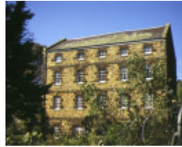
1 portarlington mill turner court portarlington front view mar1997