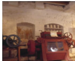
h00389 portarlington mill turner crt portarlington where drive from boilerhouse came in she project 2003