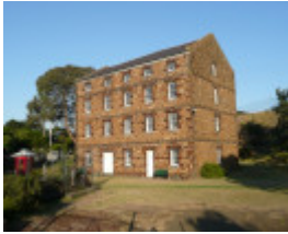
PORTARLINGTON MILL SOHE 2008