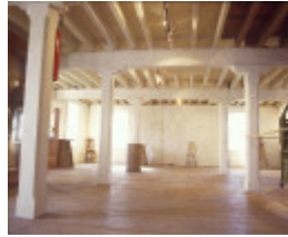
h00389 portarlington mill turner crt portarlington first floor construction she project 2003