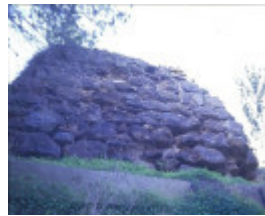
h00389 portarlington mill turner crt portarlington remains of rear boiler house she project 2003