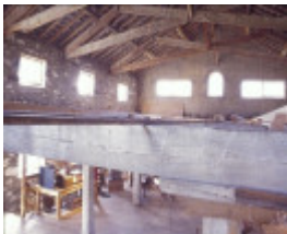
h00389 portarlington mill turner crt portarlington top floor north end she project 2003