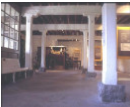
h00389 portarlington mill turner crt portarlington ground floor she project 2003