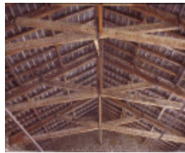
h00389 portarlington mill turner crt portarlington scissor beam construction under roof she project 2003