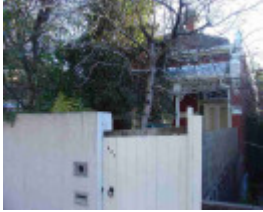
clifton hill hoddle street clifton hill hoddle street 497