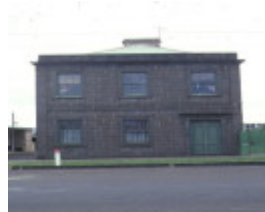
1 residence 70 julia street portland front view