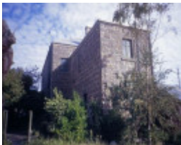
dr grier residence julia street portland rear east side she project 2003