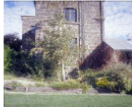
dr grier residence julia street portland north end she project 2003