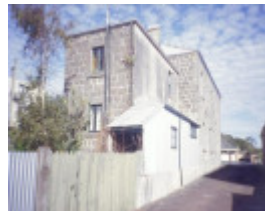
dr grier residence julia street portland west side she project 2003