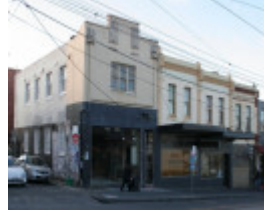
Fitzroy Gertrude St 237.JPG