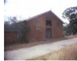
belmont raglan rd beaufort stables mar1985