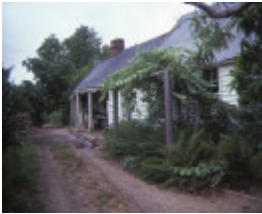
belmont raglan road beaufort side view homestead mar1985