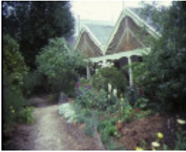
1 belmont raglan rd beaufort front view house mar1985