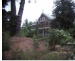
belmont raglan rd beaufort rear view house mar1985