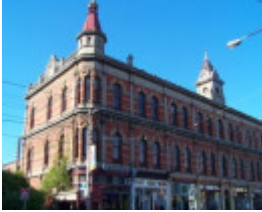
236-252 Brunswick Street