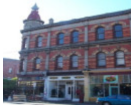
236-252 Brunswick Street