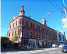
236-252 Brunswick Street