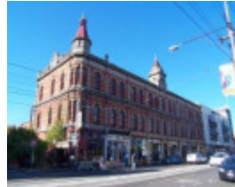
236-252 Brunswick Street