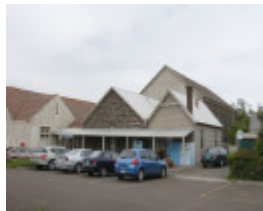
FORMER WESLEYAN CHURCH SOHE 2008