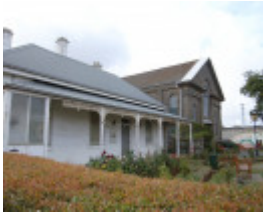
FORMER WESLEYAN CHURCH SOHE 2008