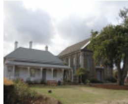
FORMER WESLEYAN CHURCH SOHE 2008