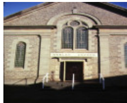
former wesleyan church portland front view of church jun1981