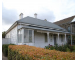
FORMER WESLEYAN CHURCH SOHE 2008