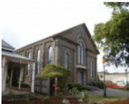
FORMER WESLEYAN CHURCH SOHE 2008