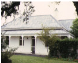
1 former wesleyan church portland manse front view