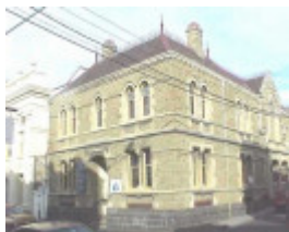
h00542 former police station and court house greville street prahran she project 2004