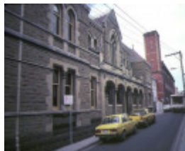
1 former police station & court house cnr greville street prahran front view oct1982