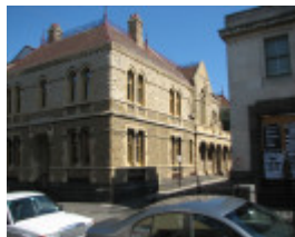
FORMER POLICE STATION AND COURT HOUSE SOHE 2008