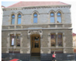
FORMER POLICE STATION AND COURT HOUSE SOHE 2008