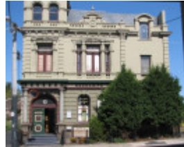
FORMER RECHABITE HALL SOHE 2008