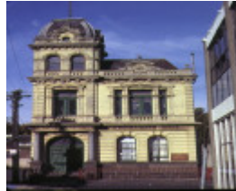
1 former rechabite hall little chapel street prahran front view