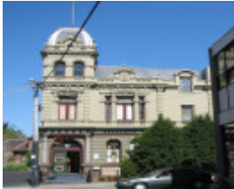
FORMER RECHABITE HALL SOHE 2008