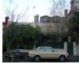
Fitzroy George St 112- 114.JPG