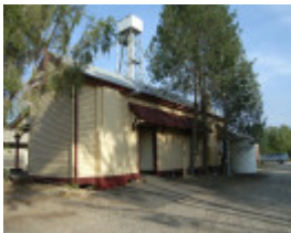
PYRAMID HILL RAILWAY STATION SOHE 2008