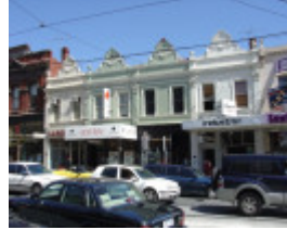
Bridge Rd 38-44.JPG