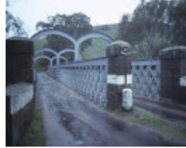
1 Redesdale Bridge redesdale end of bridge