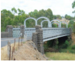
Redesdale Bridge aerial view