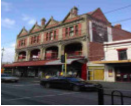
Fitzroy Gertrude Street 158-162.JPG