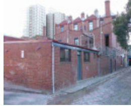
Fitzroy Gertrude Street 158-162 rear.JPG