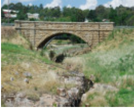
NEWTOWN BRIDGE PRECINCT SOHE 2008