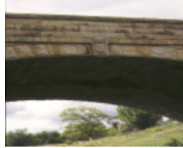
newtown bridge precinct beechworth detail of bridge arch & keystone