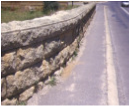
newtown bridge precinct beechworth side wall of bridge