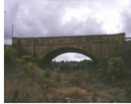
newtown bridge precinct beechworth side elevation