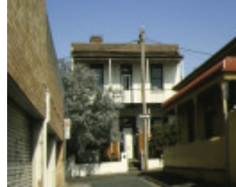
1 residence 18 berry street richmond front view