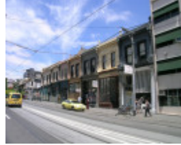
fitzroy brunswick street fitzroy brunswick street 63 DSCN7935.JPG