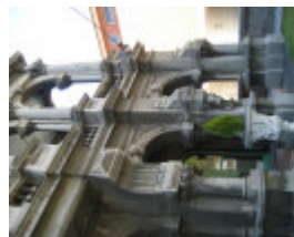
Former Lalor House facade 2009