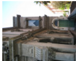
former lalor house 2009