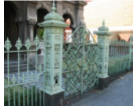
FORMER LALOR HOUSE SOHE 2008