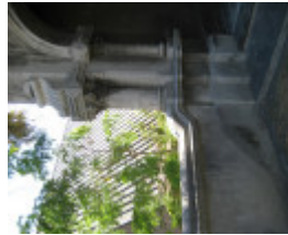
Former Lalor House front