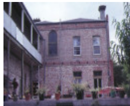
1 former lalor house church street richmond rear view