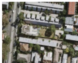
Former Lalor House Aerial.jpg