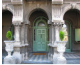
FORMER LALOR HOUSE SOHE 2008