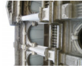
Former lalor house facade 2009