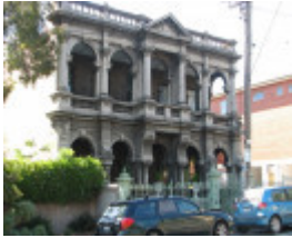
FORMER LALOR HOUSE SOHE 2008