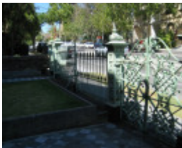
Palisade iron fence