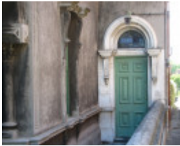
FORMER LALOR HOUSE SOHE 2008