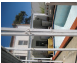
Former Lalor House Rear view 2009