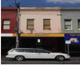
collingwood smith street collingwood smith street 238