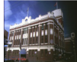
1 former bryant & may industrial complex church street richmond front view nov1984