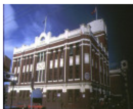
1 former bryant & may industrial complex church street richmond front view nov1984