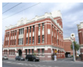
FORMER BRYANT & MAY INDUSTRIAL COMPLEX SOHE 2008