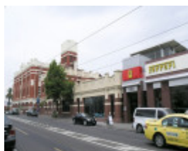
FORMER BRYANT & MAY INDUSTRIAL COMPLEX SOHE 2008