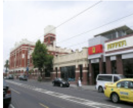
FORMER BRYANT & MAY INDUSTRIAL COMPLEX SOHE 2008