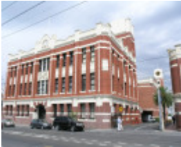
FORMER BRYANT & MAY INDUSTRIAL COMPLEX SOHE 2008