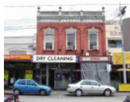
Richmond Swan Street 178- 180.JPG