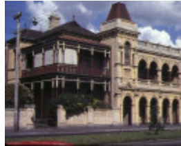
1 urbrae hoddle street richmond front view