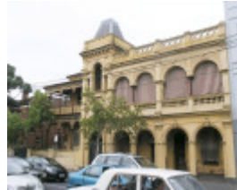
URBRAE SOHE 2008