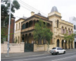
URBRAE SOHE 2008