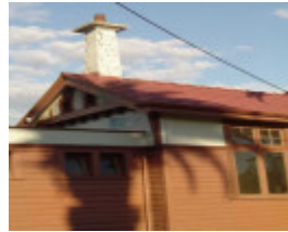
Ripponlea Railway Station 2004