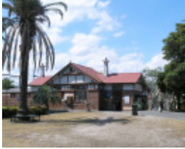
RIPPONLEA RAILWAY STATION COMPLEX SOHE 2008