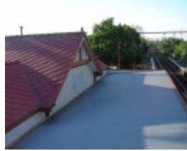
Ripponlea Railway Station 2004