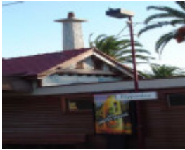
Ripponlea Railway Station 2004