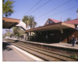
1 ripponlea railway station complex glen eira road riponlea upside building aug1998