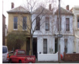
7-11 Moor Street.JPG