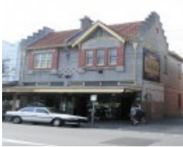
BRINSMEADS PHARMACY SOHE 2008