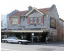
BRINSMEADS PHARMACY SOHE 2008