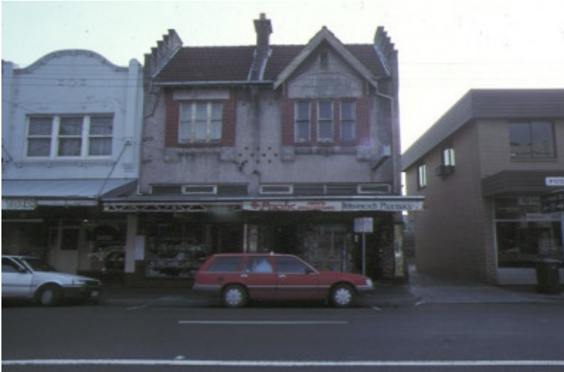
1 brinsmeads pharmacy glen eira road ripponlea front view