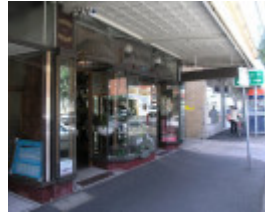
BRINSMEADS PHARMACY SOHE 2008