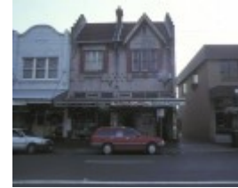
1 brinsmeads pharmacy glen eira road ripponlea front view