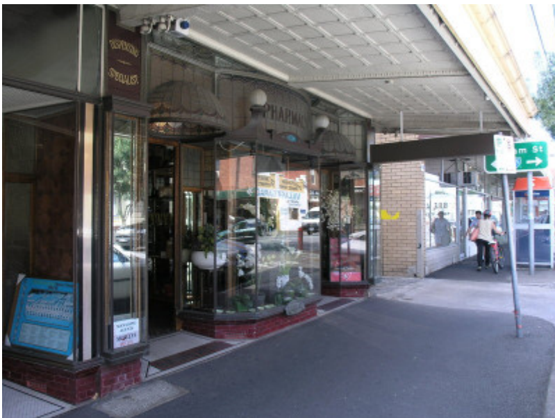
BRINSMEADS PHARMACY SOHE 2008