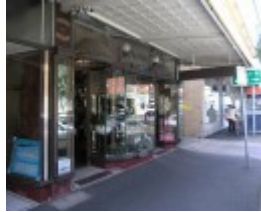
BRINSMEADS PHARMACY SOHE 2008