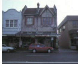
1 brinsmeads pharmacy glen eira road ripponlea front view