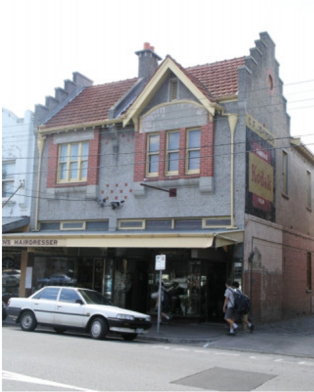
BRINSMEADS PHARMACY SOHE 2008