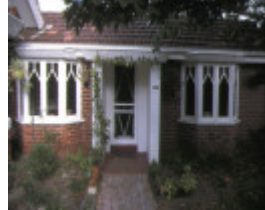
1 tintara lyndon street riponlea front entrance apr1989