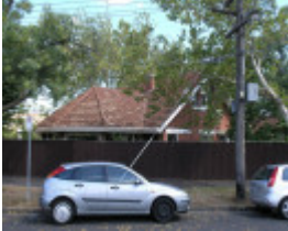
TINTARA SOHE 2008