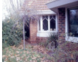
h00842 tintara lyndon street riponlea bay window dining room she project 2003