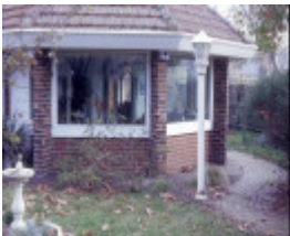
h00842 tintara lyndon street riponlea sunroom she project 2003