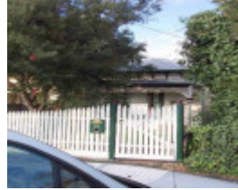
Fitzroy North Fergie Street 86 v2.JPG