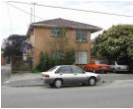
collingwood sackville street collingwood sackville street 96a unit 1-6